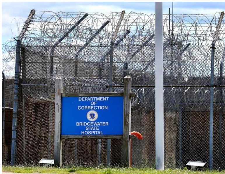
Exterior barbed wire fence and exterior sign at Bridgewater State Hospital.

A Report to the President of the Senate, Speaker of the House of Representatives, Chairs of the Joint Committee on Mental Health Substance Use and Recovery, Joint Committee on the Judiciary, Senate Ways and Means Committee, and House Ways and Means Committee, submitted pursuant to the FY 2020 Budget (Line Item #8900-0001.)